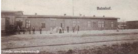
Domowce w Kruszwicy z przełomu XIX i XX wieków