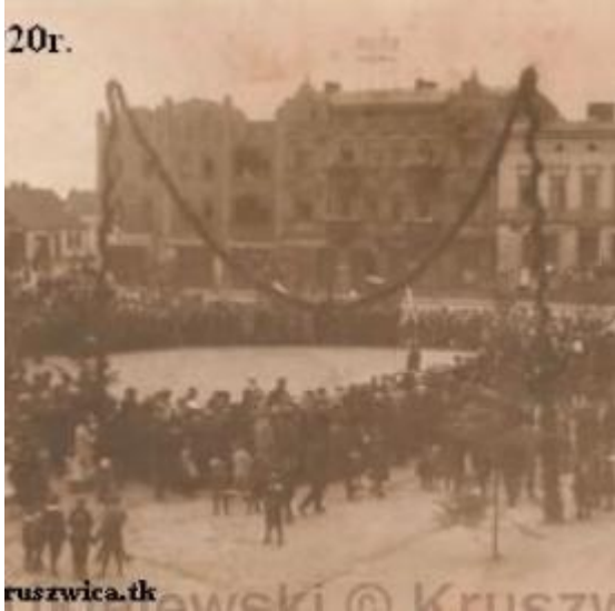
kruszwica.pl ewski @ Kruszw