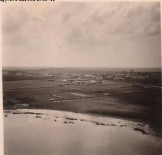
Zdjęcia z okresu 1940-41