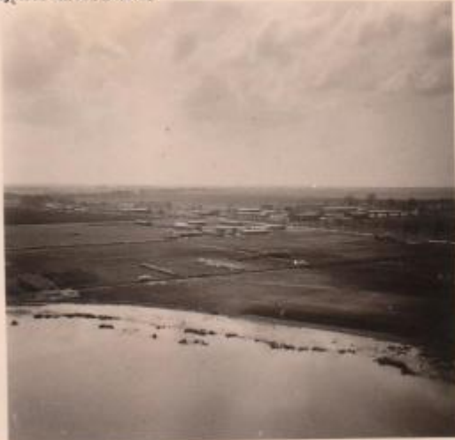
Zdjęcia z okresu 1940-41